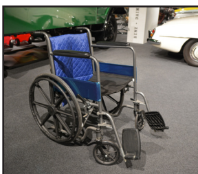
2 x wheelchairs