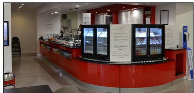
Café 750 Counter