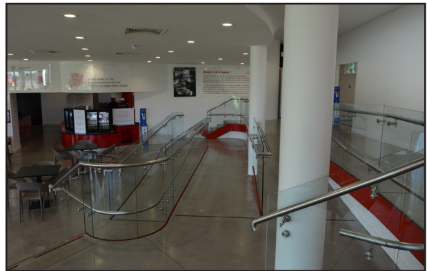
Café 750 ramp