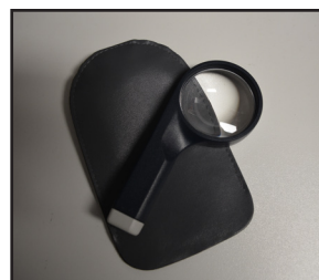
Large magnifying glasses