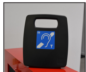
Portable induction loops