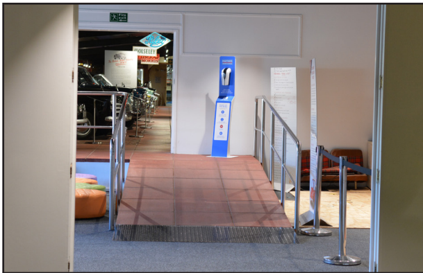
Families room ramp