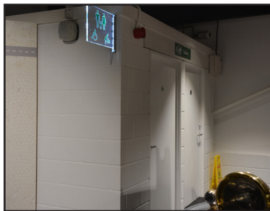
Vintage & Veteran Toilets