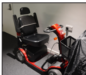
2 x mobility scooters